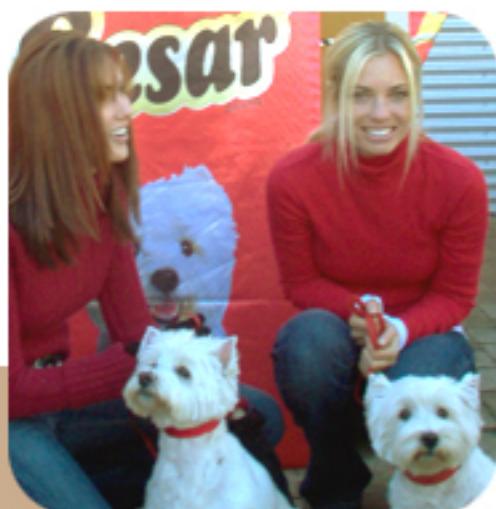
Photo at right : Two models pose with the CESAR® Westies at the Sundance Film Festival, 2005.

CESAR® is an ongoing sponsor of the annual Sundance Film Festival, held in Park City, Utah each January. The festival is considered the premier U.S. showcase for American and international independent film. This year's sponsorship included a cocktail party and sweepstakes giveaway for a 5 day/4 night trip for 2 people and their dog to Park City to attend the 2006 Sundance Film Festival.