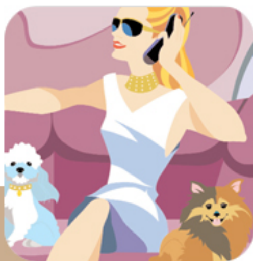
Yappy Hour ...benefits local non-profit animal rescue groups across the country. Attend one near you!

Animal Fair's Yappy Hour event, benefiting local non-profit Animal Rescue Groups across the country, kicked off its 15-city tour in Boston recently and was a huge success! The event raised over $8,000 dollars for the Animal Rescue League of Boston and we are happy to say all the dogs were adopted! CESAR® was on hand as a proud sponsor. Click here for dates and details in upcoming cities.