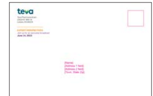
Back Cover (9"W × 6"H)

Prescribing Information (folded to 5.5" × 4.25") spot glued on inside bottom panel