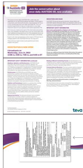
Inside Full Open (9"W × 17.875"H)