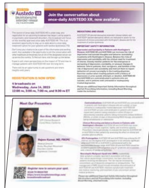
Inside Half Open (9"W × 12"H)