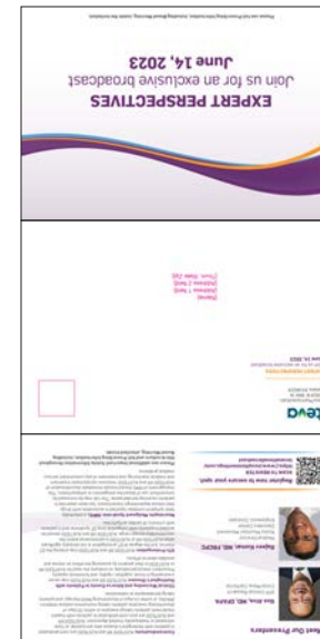
Outside Full Open (9"W × 17.875"H)