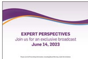
Front Cover (9"W × 6"H)

Please note, this layout indicator is for illustrative purposes only and is not intended for content review.